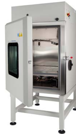
EXT2.0 with optional stand