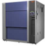
Large Capacity Thermal Shock Chamber 603EL (600L)