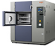
Air to Air Thermal Shock Chamber with Humidity