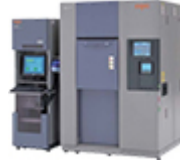
Highly Accelerated Air to Air Thermal Shock Chamber (HAATS)