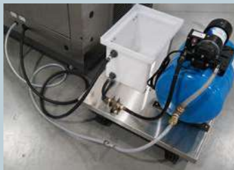
System has a recirculation mode and holds 11 gallons