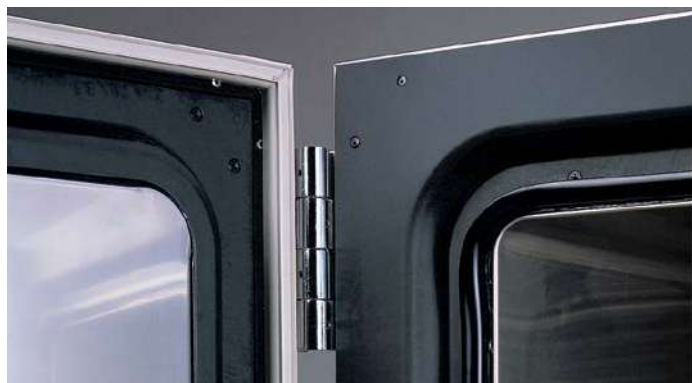
Rounded interior corners and black resin thermal breaks around the door and doorframe are unique features found only on ESPEC chambers.