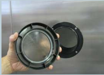
2", 4", or 6" diameters available