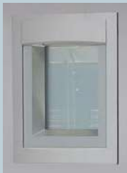
8 & 14 cu. ft.: 9" x 10.3" window 32 cu. ft.: 17" x 10" window