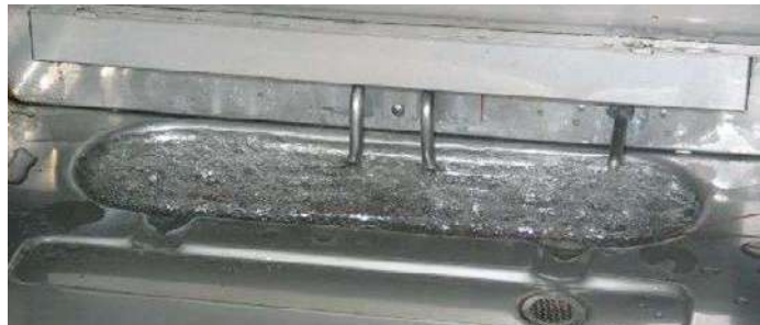
A humidity bath heats water right in the chamber for faster response, and is easier to maintain than traditional steam generators.