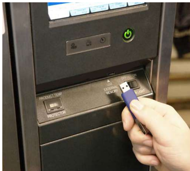
New: Upload and download programs via USB thumb drive.

Easy to understand screens allow access to chamber and test configuration settings. The P-300 now can save three different constant setups, as well as 40 test programs.